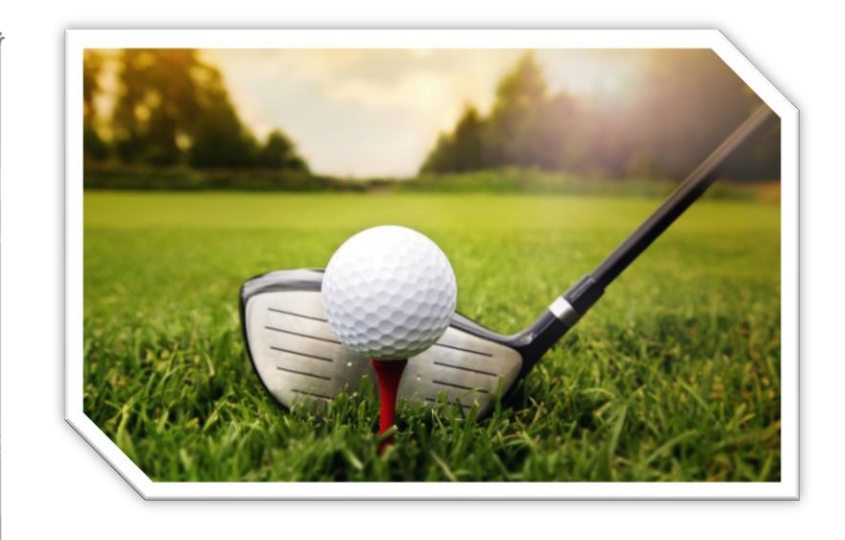
We welcome Golf Societies 7-days a week

Our aim is to offer flexibility with great hospitality and unrivalled off course facilities guaranteed to enhance your day.