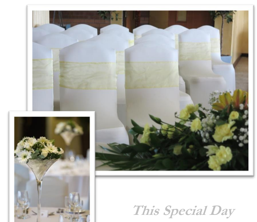
belongs to you

Room Hire, Registrars Table, Bridal Chairs, Boardroom.