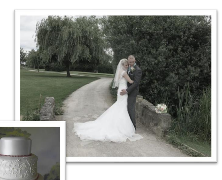
Weddings are unique and expressive of the couple for whom we celebrate

Whether it is your wish for a small intimate wedding, a traditional celebration or the grandest occasion, our wedding brochure is offered as a guide to planning your dream wedding.